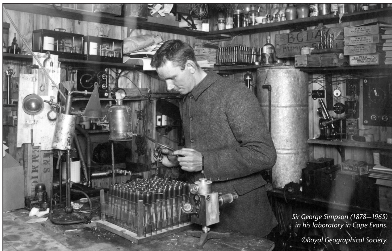
Sir George Simpson (1878–1965) in his laboratory in Cape Evans.

In the British Antarctic Expedition of 1907–1909, better known as the Nimrod expedition, Shackleton and his team pioneered the Beardmore Glacier route to the South Pole and came to within 112 miles of the South Pole by reaching 88°23'S. The expedition's other achievements were the reaching the location of the South Magnetic Pole and the first ascent of Mount Erebus.