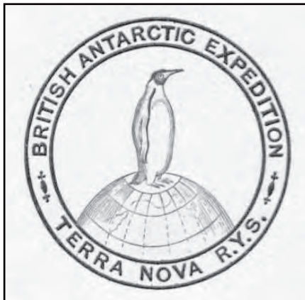
Far left: Met Office crest 1911–1939. Left: BAE 1910–13 logo.