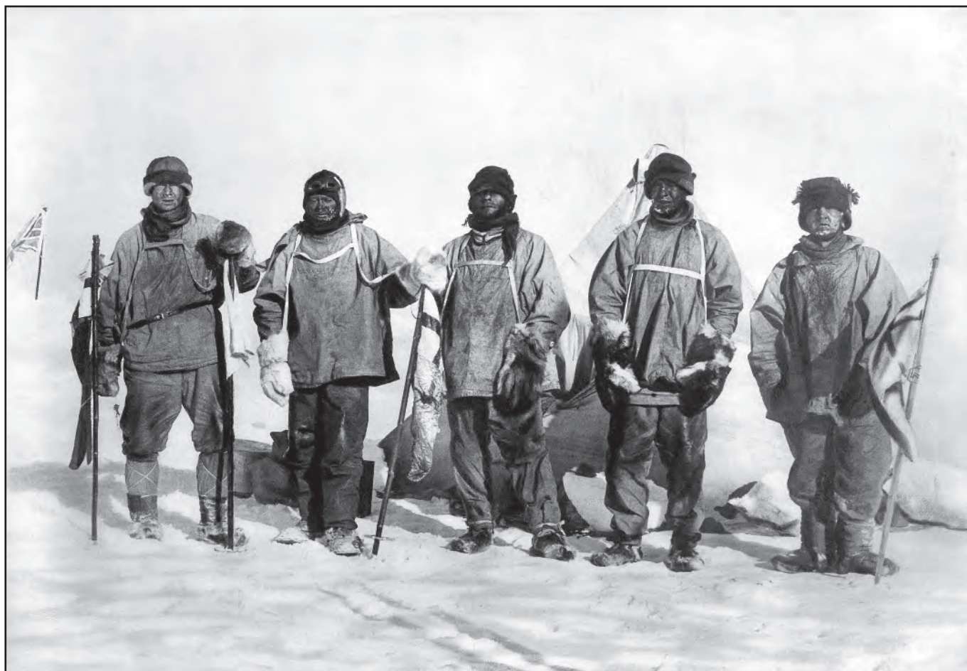
Polar Party at South Pole 18 January 1912.

While the story of Captain Scott's extraordinary adventure and tragic death is a story that still compels, fascinates and inspires, the real legacy of the expedition lies in Scott's recognition of Antarctica as a place of special scientific interest. The Terra Nova expedition established a long tradition of detailed scientific research on the continent, which continues to this day, and has enabled a greater understanding of the climate and world around us.