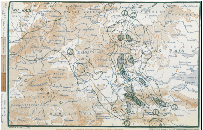
Rainfall of May 31st 1911, taken from an article in the Met Office publication of British Rainfall 1911.