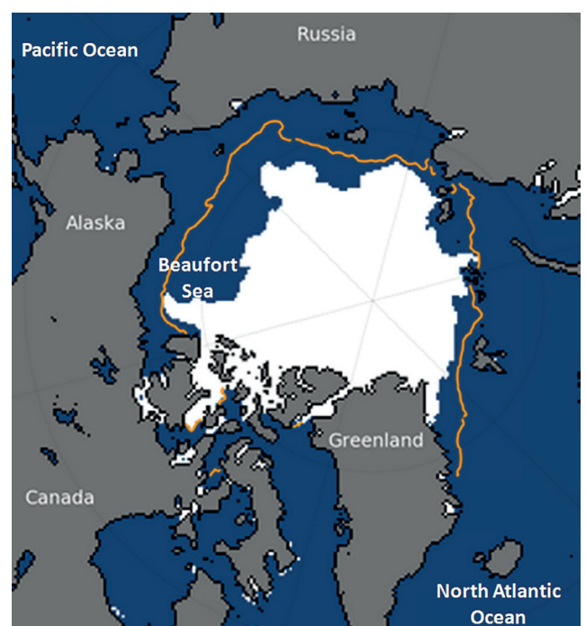
► Figure 3: Sea ice extent on 13 September 2017, with 1981-2010 average extent for this date indicated in orange.

Ice extent at minimum was exceptionally low in the Beaufort and Chukchi Seas; according to NSIDC, some parts of the Beaufort Sea saw the ice edge retreat to its furthest north on record. However, ice extent was higher than many recent years in the seas north of Russia, though still below the 1981-2010 average (Figure 3). The patterns of ice melt largely reflect the Arctic summer weather, which was mostly rather cool and stormy, with only the Beaufort and Chukchi Sea regions seeing long periods of above-average temperatures.