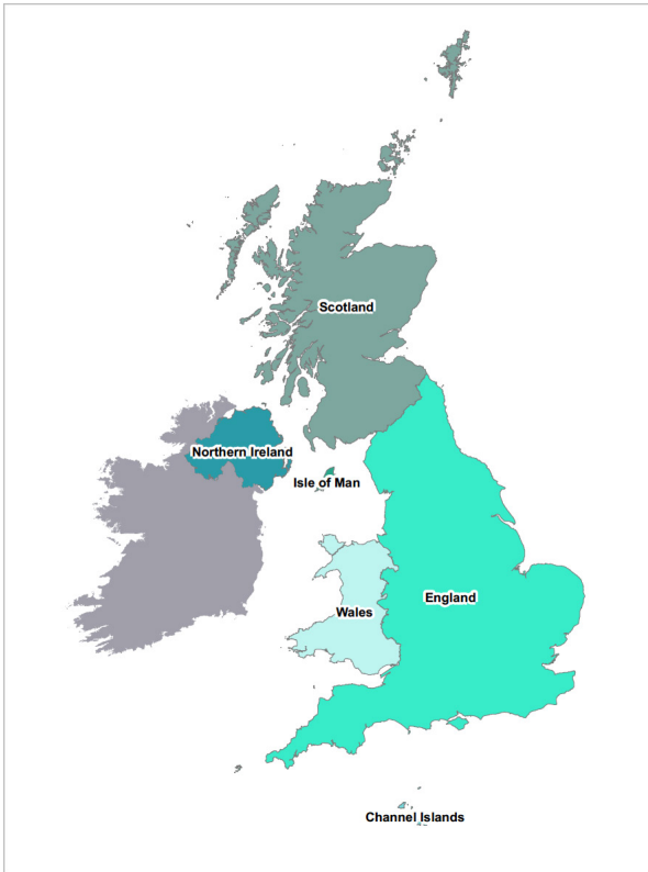
Figure 1 Map of countries used in the latest UK Climate Projections. The two regions covering United Kingdom as well as England and Wales are available too.