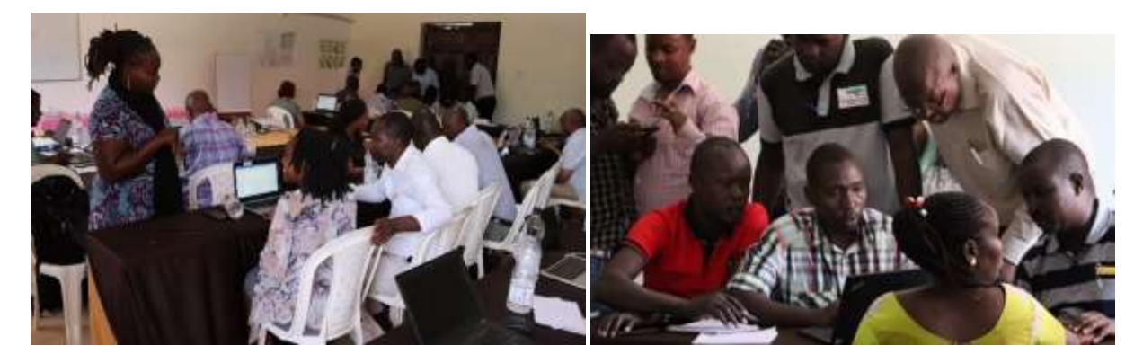
Photo: Group discussion on seasonal forecast implications at the Stakeholder Engagement Climate Forum in Lodwar, Kenya.