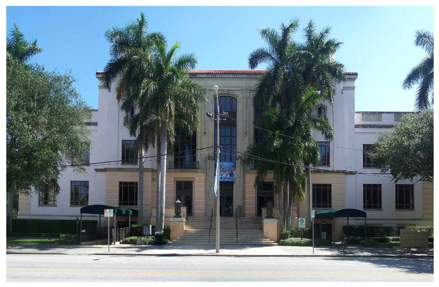
St Petersburg in Florida, USA.

• The South Pole has no sunshine for 182 days per year.