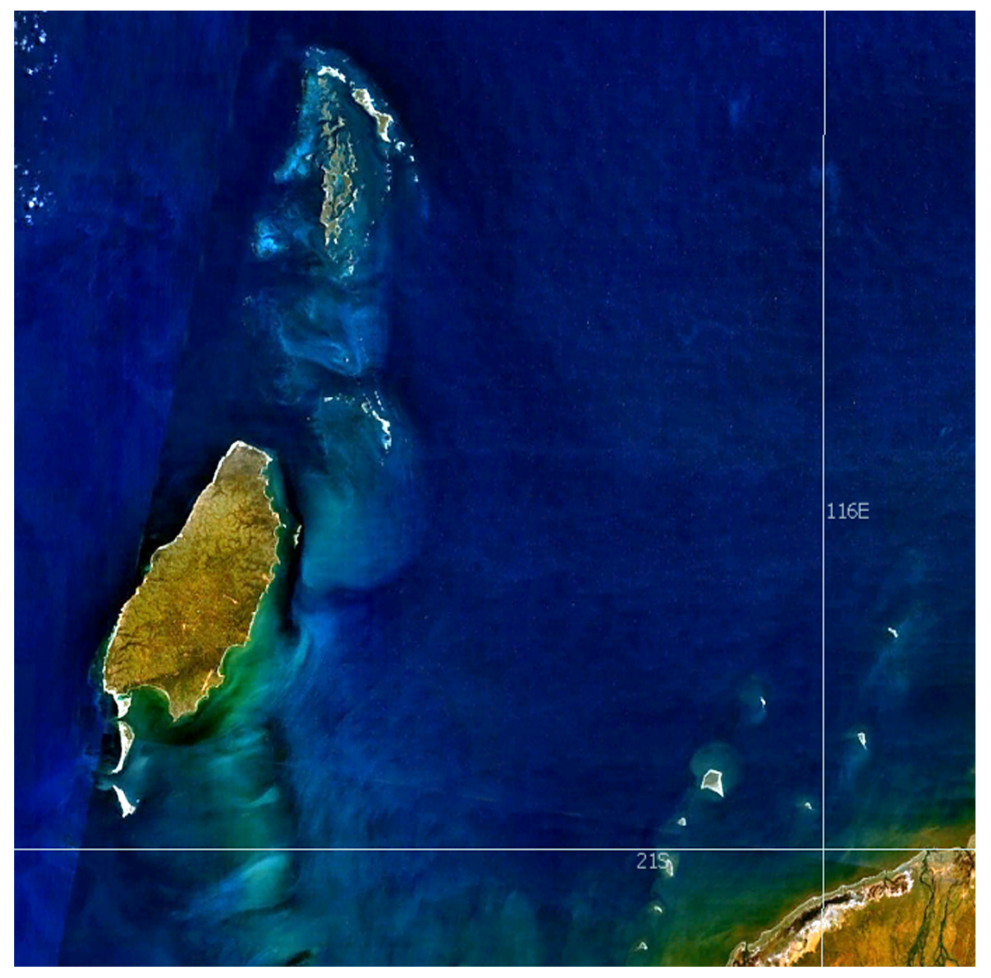
Barrow Island, Western Australia.