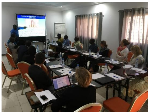
April 2018: ASPIRE Senegal Workshop hosted by ANACIM in Dakar, Senegal

There is limited understanding of ASP by weather and climate providers and of the value of weather and climate information by SP stakeholders. The project focused on facilitating dialogue between weather and climate service providers, including the regional climate centres – African Centre of Meteorological Application for Development (ACMAD) and AGRHYMET (the Regional Climate Centre for the Sahel region) – and SP stakeholders. The project also provided training to National Meteorological and Hydrological Services (NMHSs) and SP stakeholders in the Sahel region, as well as input to the PRESASS regional climate outlook forum for the Sahel. A key project outcome has been the increased awareness amongst climate and SP stakeholders of the need to align information and systems to enable more effective ASP. This has been achieved through regular meetings, training workshops, and ongoing dialogue between key stakeholders, largely facilitated by the embedded project consultant in Niger.