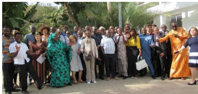
April 2019: Walker Institute led ASP Training Workshop, Dakar, Senegal.

The Walker Institute at the University of Reading led ASP training in Dakar, Senegal in April 2019, bringing together SP and climate stakeholders to discuss integrating climate information into SP planning and delivery. In September 2019, a follow-up webinar was held including 11 of the initial attendees from the April 2019 training; 10 participants represented