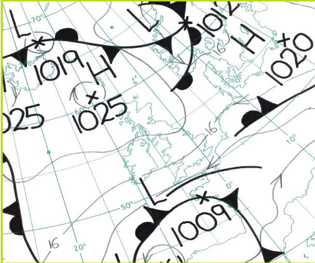
Weather chart for 1200 UTC on 14 May 2008