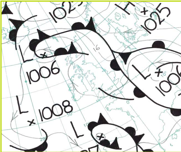
Weather chart for 1200 UTC on 29 May 2008