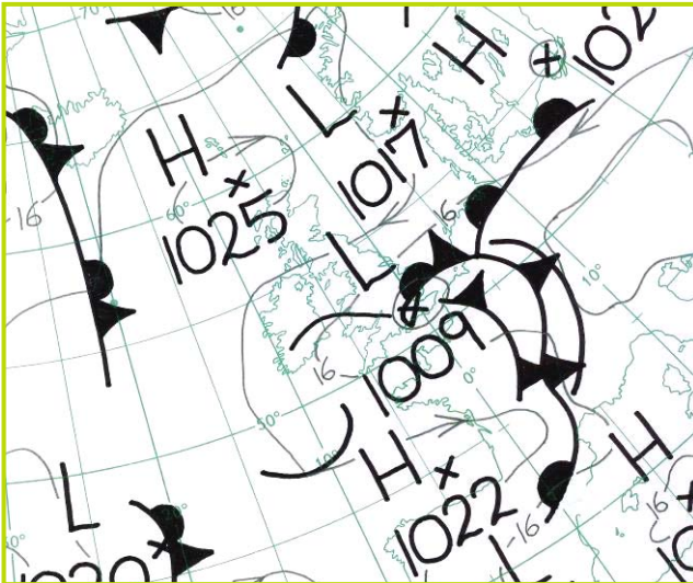
Weather chart for 1200 UTC on 20 July 2007