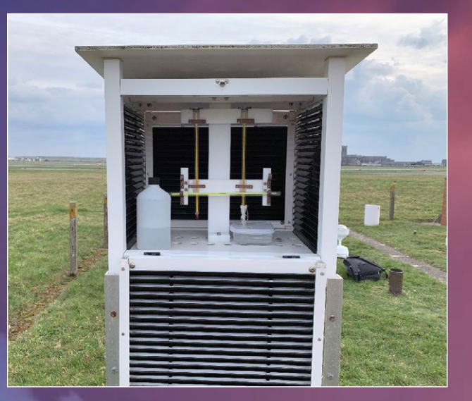
Interior of Stevenson screen showing thermometers