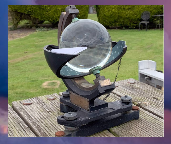
Campbell–Stokes sunshine recorder